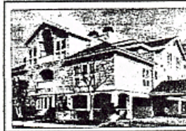
"The House That Love Built"

Approximately 12 pounds of pop tabs will cover a family's $5 room fee for a one-night stay.